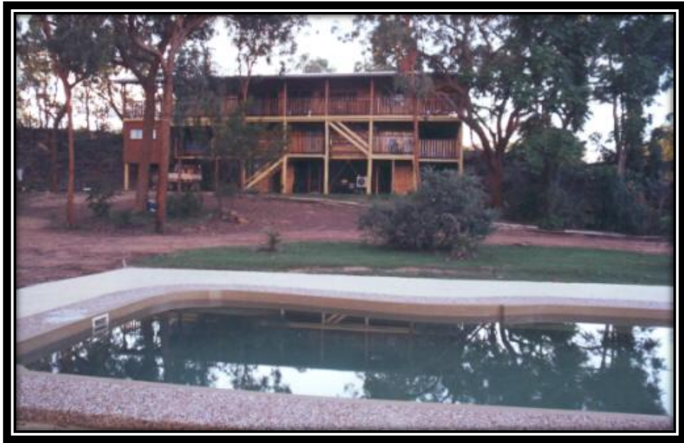
Accommodations in Queensland